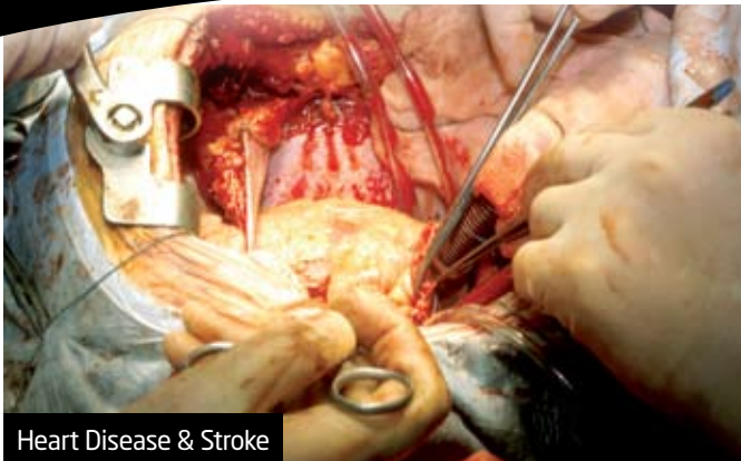
Heart Disease & Stroke

“The leading causes of death today are chronic preventable diseases” 1,2