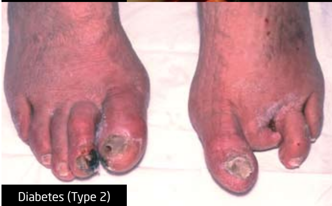
Diabetes (Type 2)